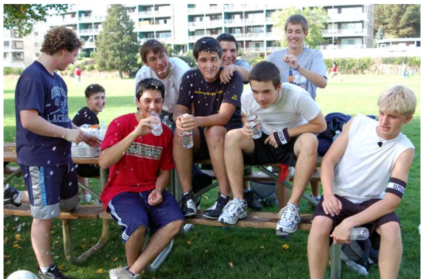
Seniors hanging out on fitness day at Ann Morison Park.